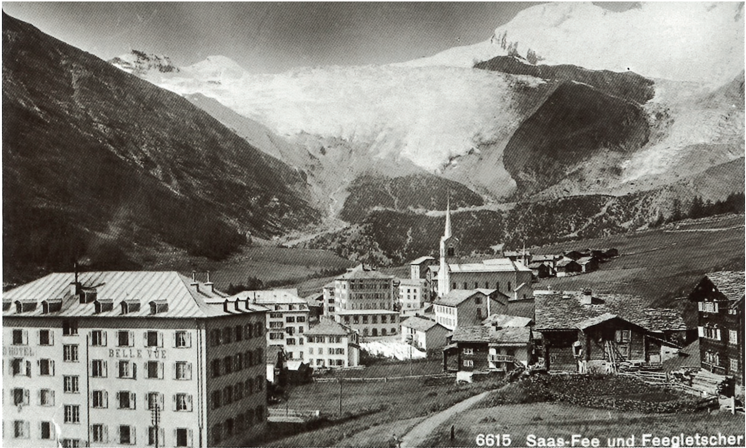
A photograph of Saas-Fee circa 1916. On the left, you can see the original Grand Hotel Belle Vue.

It was, however, just one of many. The Walliserhof was known for hosting the most extravagant events and illustrious guests. Barons, politicians, actors and singers streamed through its doors, often partying until the early hours in its club, Le Dancing. At the height of its fame, a simple glass of mineral water cost an immodest 12 francs. TV shows were filmed there, fashion shows were hosted, even Hollywood dropped in. Part of the Bill Murray movie “The Razor’s Edge” was filmed at the hotel. Thanks to a spate of food poisoning in India, where they had been shooting scenes in the Himalayas, the whole crew had to leave prematurely. They landed on Saas-Fee as the stand-in. And so, approximately 45 members of the cast and crew stayed in the Walliserhof for three weeks. During which time, Bill Murray felt so at home that he even played a DJ set in Le Dancing.